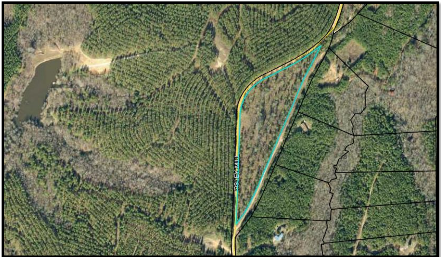
TAX ASSESSOR AERIAL