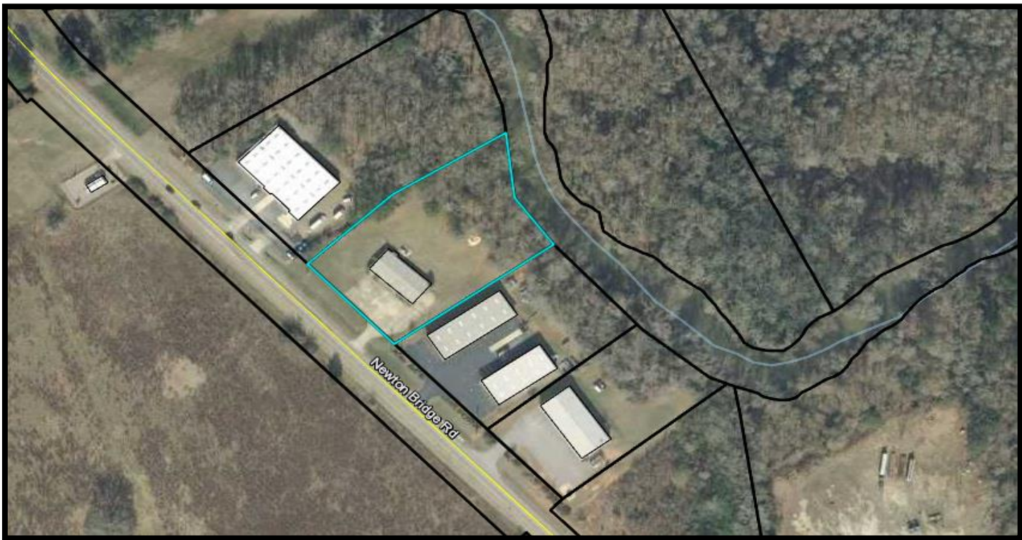
TAX ASSESSOR AERIAL