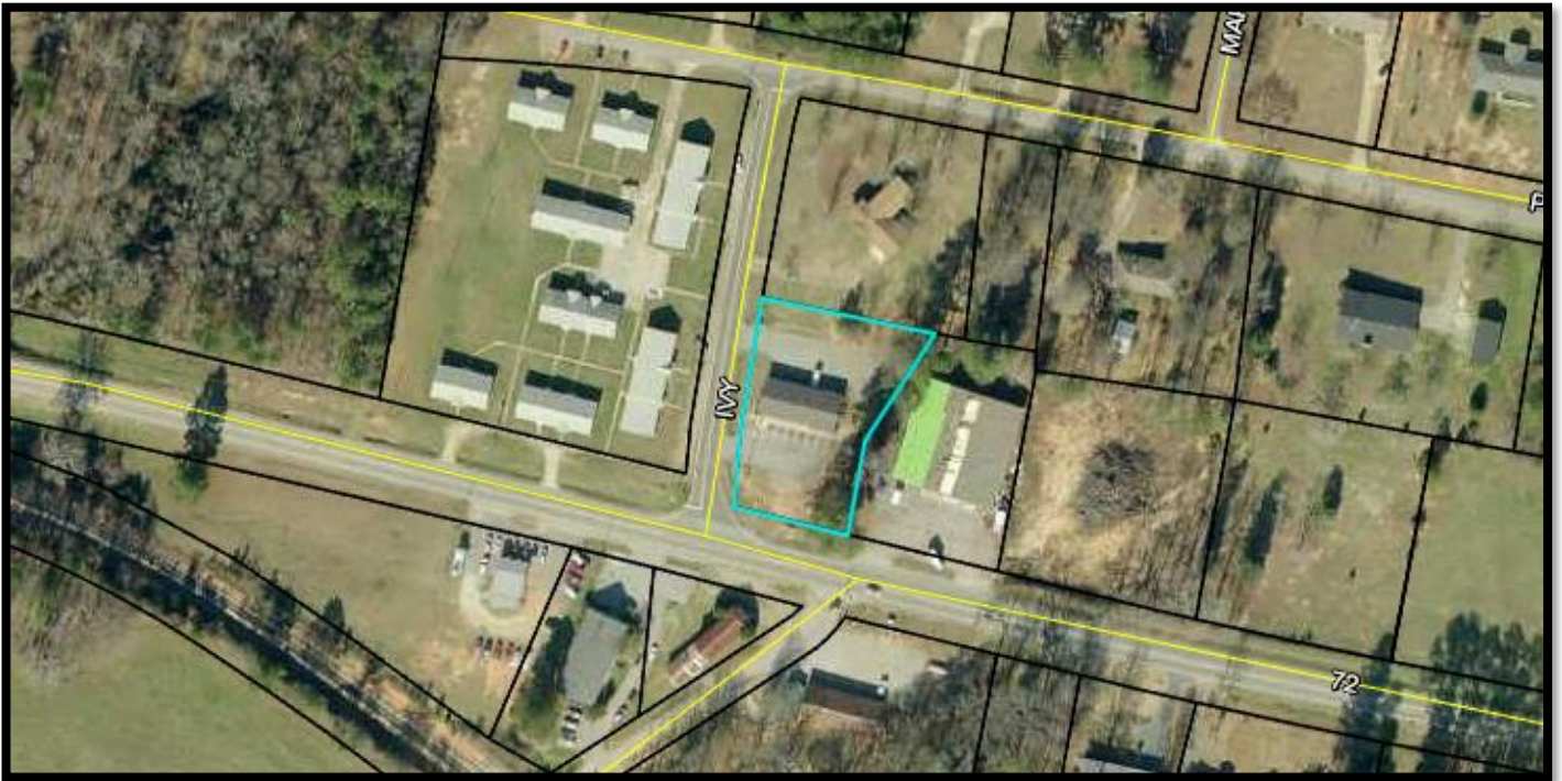
Tax Assessor Map