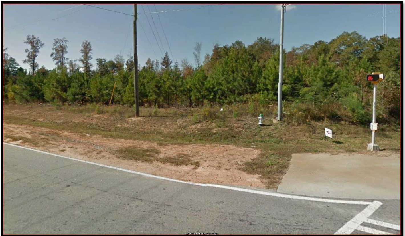
CORNER OF MORTON RD & HWY 78