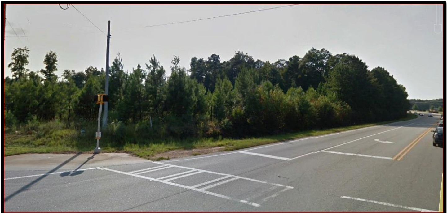
HWY 78 VIEW