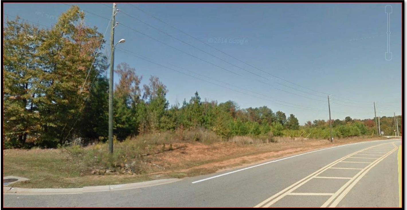
VIEW COMING UP MORTON RD