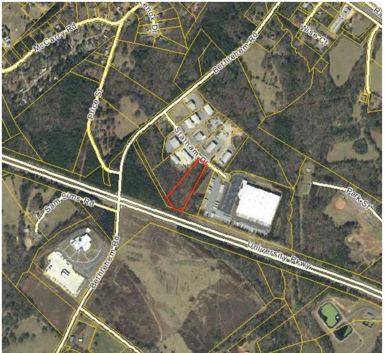
TAX ASSESSOR AERIAL