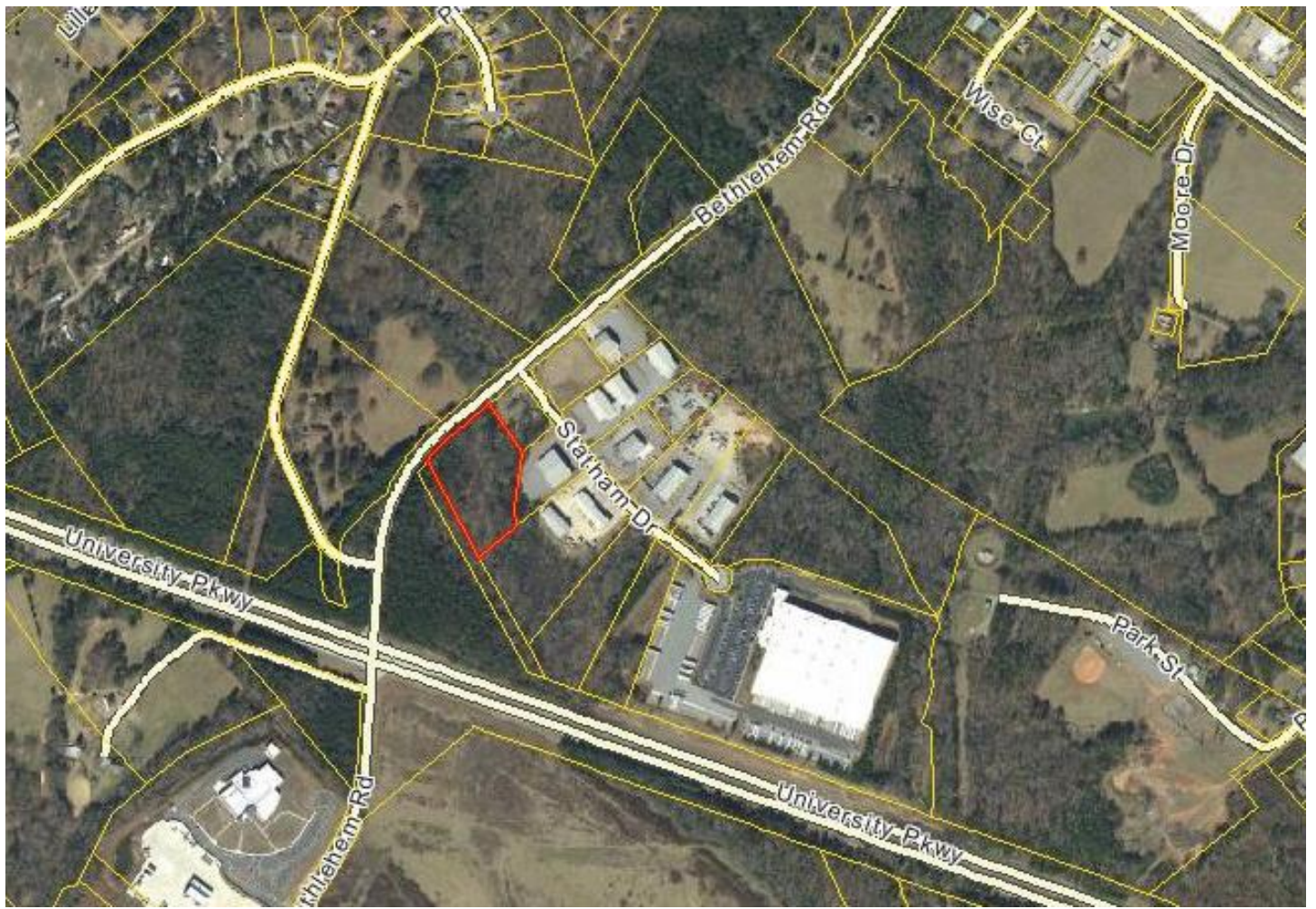
TAX ASSESSOR AERIAL